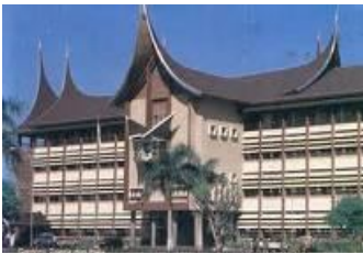
Governor Office of West Sumatra

Like Facebook : Padang International Dragon Boat Festival Indonesia