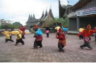
Traditional Dance of Minangkabau