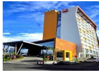
IBIS Hotel Padang (4 stars)