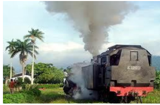
The Old Train on Sawahlunto Town.