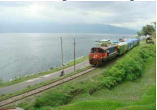
Lake Singkarak, West Sumatra