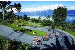
Tour de Singkarak in Padang