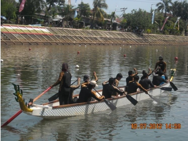
POLICE DIRAJA MALAYSIA DRAGON BOAT TEAM FROM MALAYSIA in ACTION