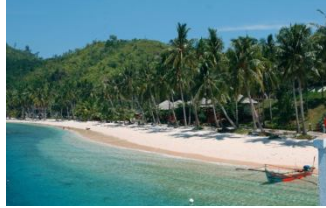
Sikuai Islands in Padang