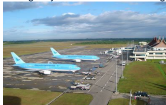
Minangkabau International Airport