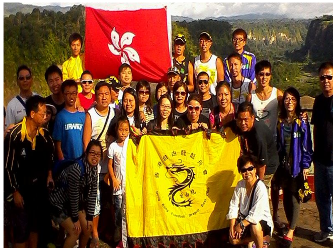
Background: SIANOK CANYON, The Biggest Amazing Canyon and No 1 in SOUTH EAST ASIA