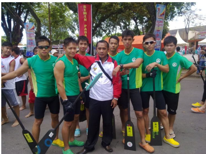
CREWS OF MACAU DRAGON BOAT ASSOCIATION FROM MACAU (left), Macau is THE RUNNER UP OPEN FEMALE 12 CREWS (right)