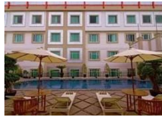
The Rocky Hotel Padang (4 Stars)