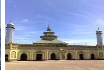
Mosque of Raya Ganting Padang