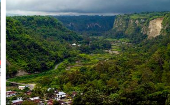
Sianok Canyon in Bukittinggi Town