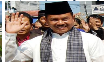
Mayor City of Padang