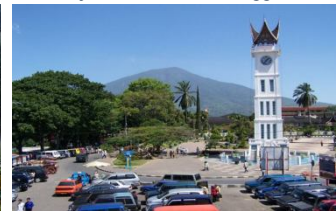
Bukittinggi Town of West Sumatra