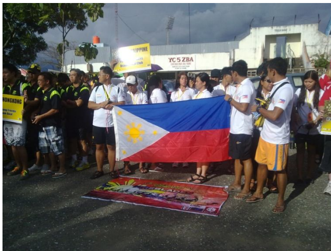
PDRT FIREBLADES PHILIPPINE (The Smart Team)