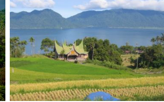
Maninjau Lake in BukittinggiTown