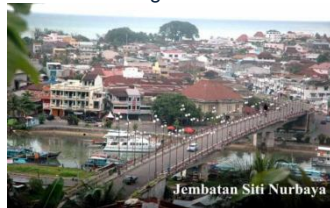
Siti Nurbaya's Bridges of Padang