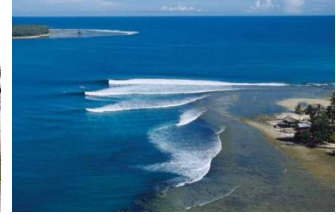
Mentawai Islands in West Sumatra