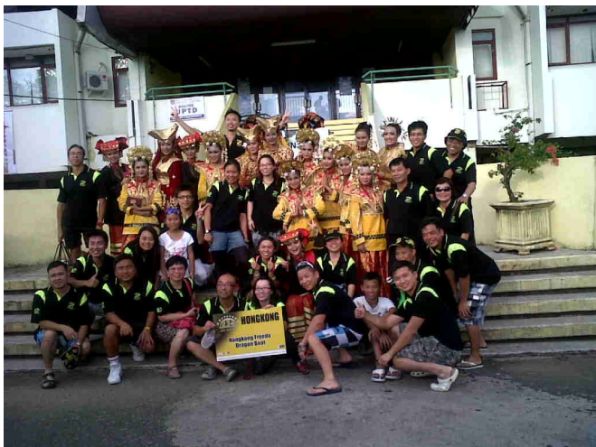
FREEDOM DRAGON BOAT CLUB FROM HONGKONG