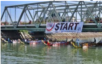
Dragonboat Event in Padang