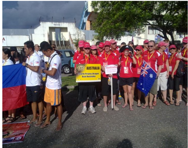
PERTH PIRATES DRAGON BOAT CLUB, WEST AUSTRALIA ( Pics: Minangkabau Airport, Left and Opening Ceremony, right)