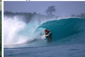
Surfing Mentawai Islands of West Sumatra