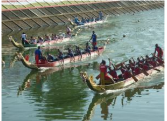
Pictures of Padang Dragon Boat Int'l Festival 2013 on Banjir Kanal's River Water Park Complex

Padang is the capital and largest city of West Sumatra, Indonesia. It is located on the western coast of Sumatra an area of 694.96 square kilometres (268.33 sq mi) and a population of up to 1,000,000 people at the 2013 years. And Banda Bakali Rivers water park, is located right in the City Centre of Padang, The Land Of Minangkabau West Sumatra Indonesia, covering an area of 200 hectares. Being an original river it focuses on the concept of a recreational park bringing an image for its uniqueness.