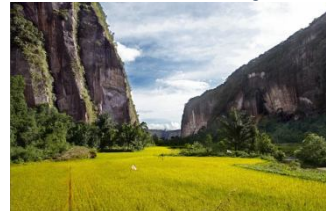
Harau Valley in Payakumbuh Town