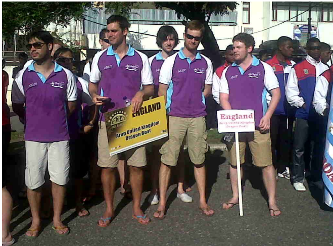
ARUP DRAGON BOAT CLUB FROM UK (England) is The Favorit Team..