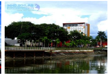
View IBIS HOTEL from Racing Venue