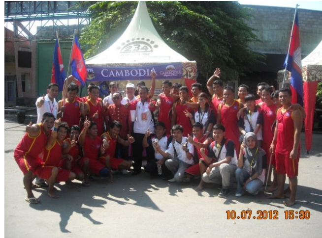
OPENING CEREMONY WITH The Vice Ministry Tourism Cambodia. Left and Cambodia National Dragon Boat Team (the Winner), Right.