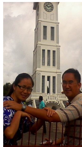
The Japanese Tunnel, Horse Bike and London's Big Ben Twin Tower of Jam Gadang in Bukittinggi, West Sumatra

Don't Forget to Like Facebook : Padang International Dragon Boat Festival Indonesia