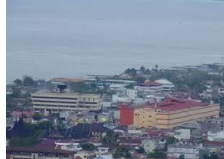
Padang City from Mount of Padang