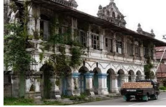
The Old Town in Padang