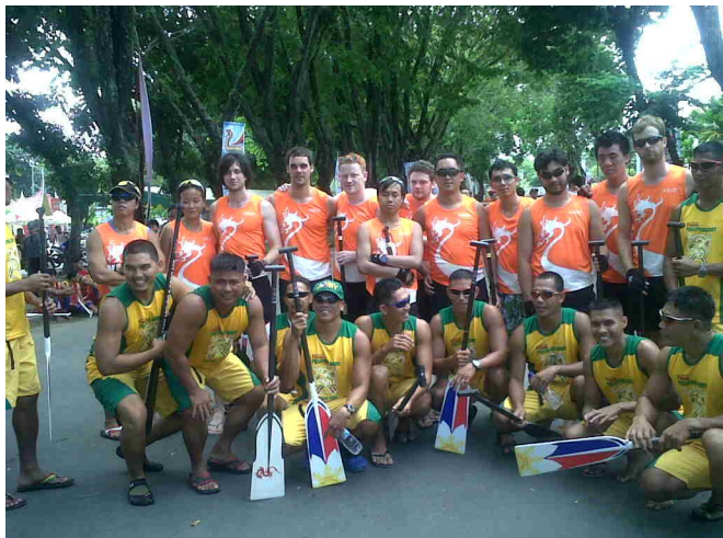
ARMY PHILIPPINE DRAGON BOAT TEAM with Arup Team UK (Left) and Army Team is The Winner Open Male 12 Crews