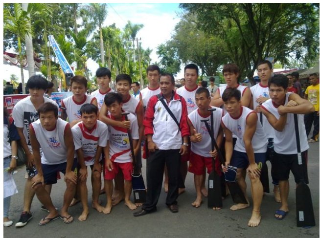
Nanning Dragon Boat From China. :Pics : Welcoming in Minangkabau Airport, Left & on race venue Arena, Right.