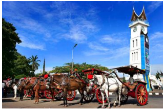
Gadang Clock Tower Bukittinggi Town.