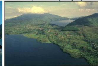
Twin Lake Solok of West Sumatra