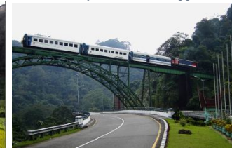
Anai Valley in Padang Panjang Town