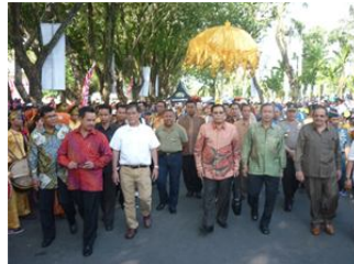
Opening Ceremony Padang Dragon Boat Int'l of Mayor City & Minangkabau Traditional Costumes