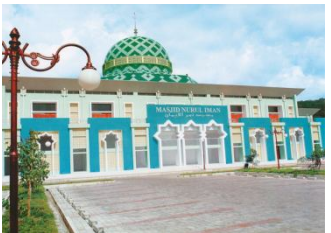
Nurul Iman Mosque in Padang