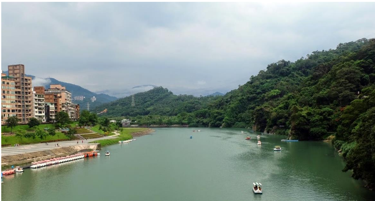
Front view : Bi-tan racing venue