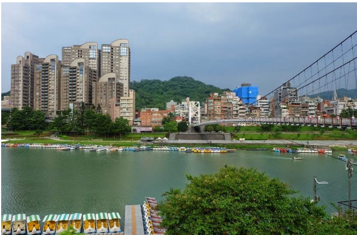
Side view : Bi-tan racing venue