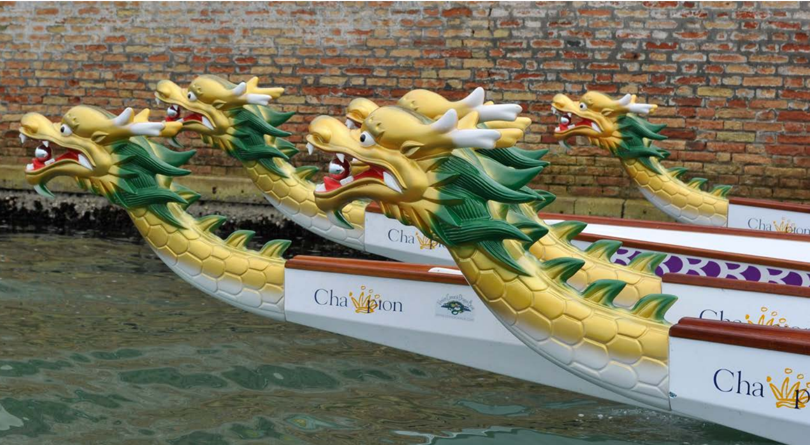
Dragon Boat Heads in Venice